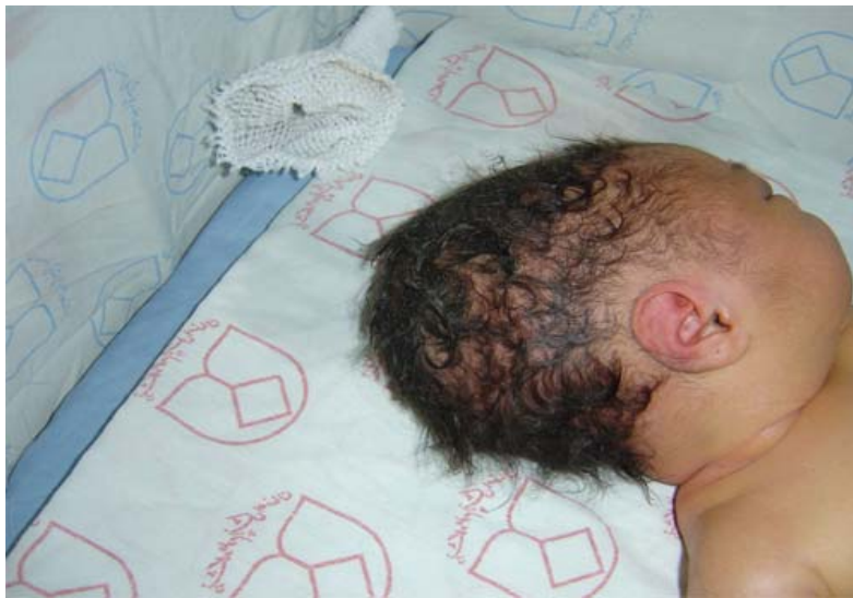
Fig 2- A sever fluctuant swelling on the head of our patient with Subgaleal hemorrhage